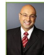
Ali Velshi Chief Business Correspondent CNN New York City