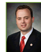
Legislative Representative: Kirk Adams Speaker of the House Arizona House of Representatives Phoenix, Arizona