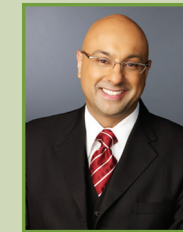
Ali Velshi Chief Business Correspondent CNN New York City

SPONSORED BY: REALTY RESOLUTION ADVISORS, LLC